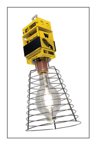
400W Metal Halide High Bay